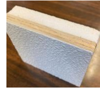
1" ADA Wall Cut Away