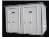
Two Stall with ADA Lavatory.