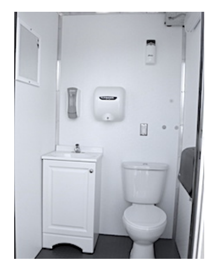
External Plumbing for High Traffic Areas