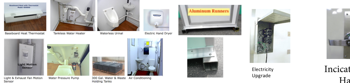
Incicator Door Handle

Ceramic Fixtures – 9 Second Water Faucet – Mixer Water Faucet (with Optional Hot Water) – Electricity – Exhaust Fan – Safety Light – Smoke Detector – Paper Towel Dispenser – 9" Toilet Paper Dispenser – Foaming Hand Soap Dispenser (with soap) - Coin Vinyl Flooring – Treated Wood Runners – Clothes Hooks – Inside Privacy Lock – Outside Keyed Door Lock – 1" Graffiti Resistant Walls – Light Switch for Safety Light and Exhaust Fan – Mirror – Wastebasket – Encapsulated Wall Edges - Consumables - 36"Door with Four Hinges