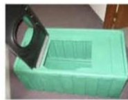
Fliptop Open for Easy Cleaning