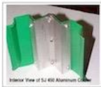
Inside Aluminum Corner for Durability