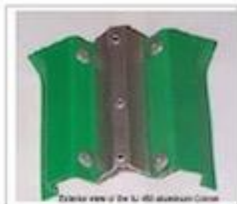
Aluminum Corners for Long Life