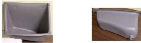
Standard Portable Toilet Urinal - Can be Mounted on a Wall and Drain into the Holding Tank. Ships with Mounting Fasteners. Urinal and Consumables ship inside the Holding Tank