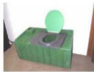
Fliptop Tank with Open Lid