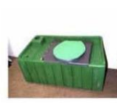
Fliptop Lid Closed

Each portable toilet holding tank has a flip-top cover with a molded toilet seat and a toilet seat cover.