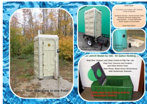
Green John Pictures