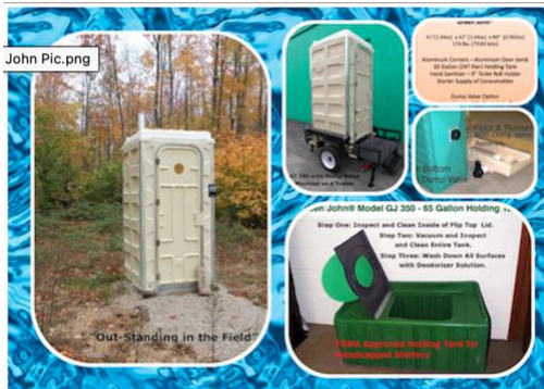
Fig. 3 Green John® Fig. 4 Green John® Pictures www.PortableToilets.com *

https://040f0182-6612-4d42-a330-0c681ddcf2.filesusr.com/ugd/693cc3_a141cf4ca97c4dd1b7e229f9509e148d.pdf