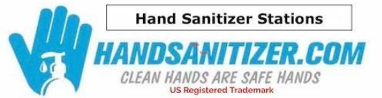
Fig.10 Handsanitizer Trademark

The products and concepts can be viewed in detail on www.Toilets.com .