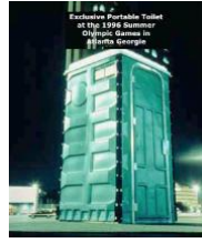
Fig. 6. 1996 Olympics