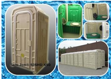
Fig. 1 Sani-Jon® Fig. 2 San Jon® Pictures www.PortableToilet.com *

https://040f0182-6612-4d42-a330-0c681ddcf2.filesusr.com/ugd/693cc3_662e0b9d467f40108a320c5a32eb0d25.pdf