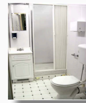
ADA Compliant Ground Level Lavatory Buildings Exterior Plumbing Upgrade Not Shown