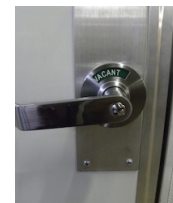
Usage Indicator Door Handle