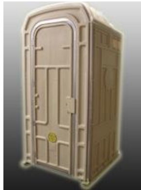
SJSDCS 520 Comfort