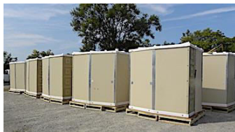
Ready to Ship With Removable Base for Ground Level