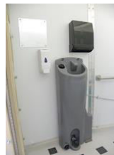
Option Sink – Foaming Hand Soap Dispenser And Paper Towel Dispenser