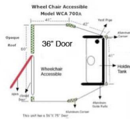
Model 700A Drawing.

No Handicapped Portable Toilets are ADA compliant. We manufacture a Model SBADA 7777 Lavatory building that is ADA Compliant. (See SBADA 7777 Cut Sheet)