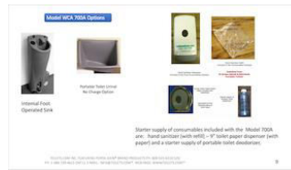
Consumable and Urinal Included