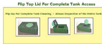
Standard 65 Gallon Holding Tank.