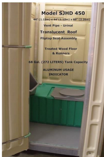
SJHD 450 Heavy Duty Portable Toilet