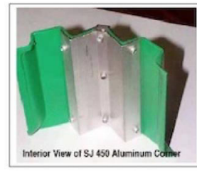
Inside Aluminum Corner for Durability

Dual Aluminum Corners - A Clamshell Door - Translucent Roof 68 (272 Liters) Gallon Holding Tank - Flip Top Toilet Seat Lid - Urinal - Vent Pipe Aluminum Door Frame - Hand Sanitizer with Gel - 9" Toilet Tissue Holder (with Paper)