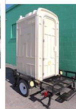
External and Internal 12 Gallon Sink in a SJHD 450

Flip top For Complete Tank Cleaning - Allows Inspection of the Entire Tank