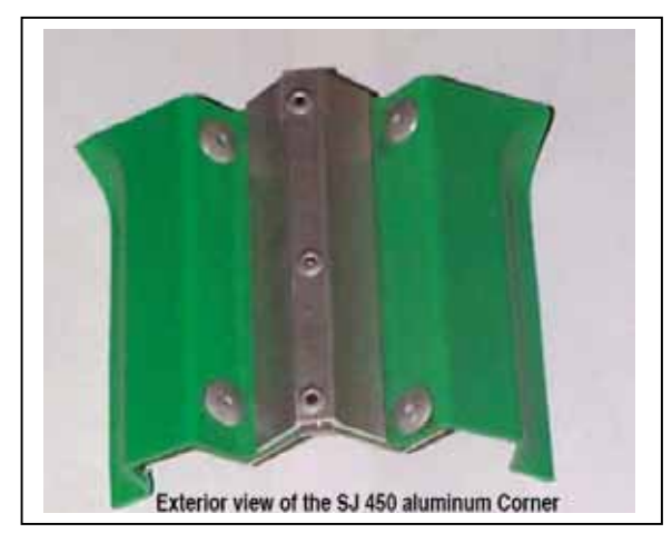
Outside Aluminum Corners for Long Life