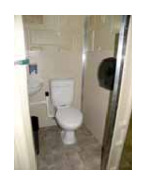
Model SJSDCS 520