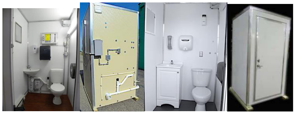
Upscale Lavatory Buildings