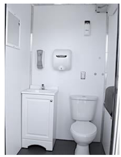
External Plumbing Upgrade For High Traffic Areas