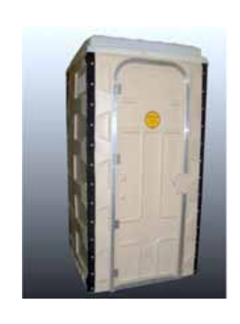
Model FPT 300 Dimensions