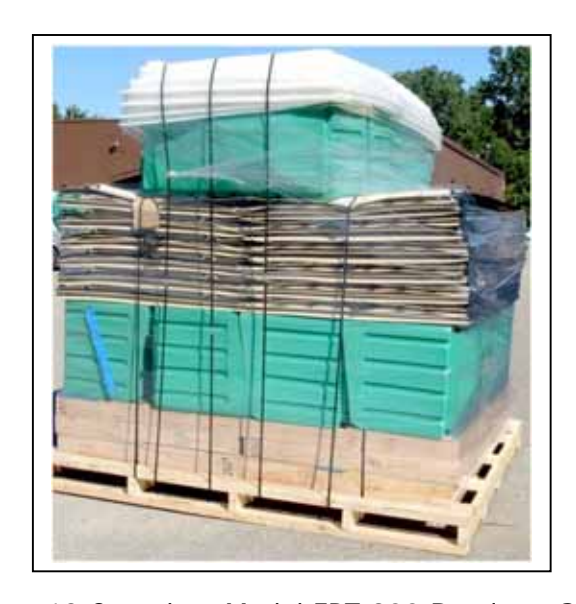
12 Complete Model FPT 300 Ready to Ship

Cost Efficient Loading & Shipping Options